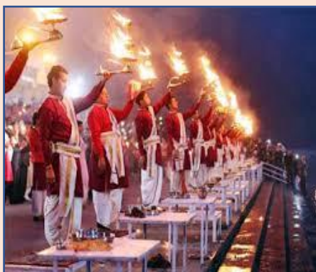
Ganga Arti, Triveni, Rishikesh