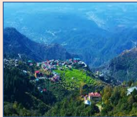
Mussoorie – Queen of Hills