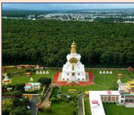
Buddha Temple, Dehradun