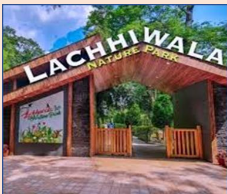
Lachhiwala Nature Park, Dehradun