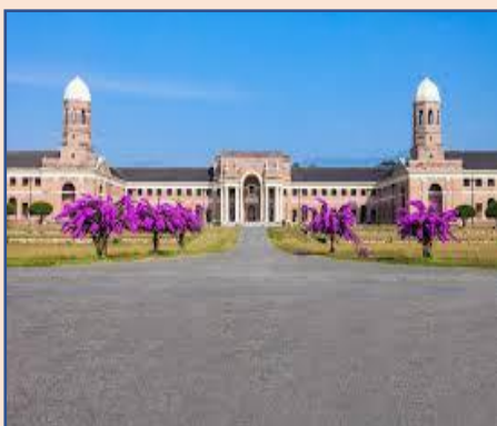
Forest Research Institute, Dehradun