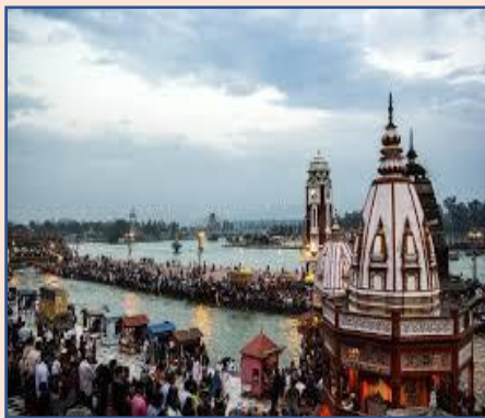
Har ki Pauri, Haridwar, a sacred ghat