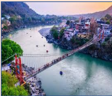
Rishikesh – Yoga Capital of the World