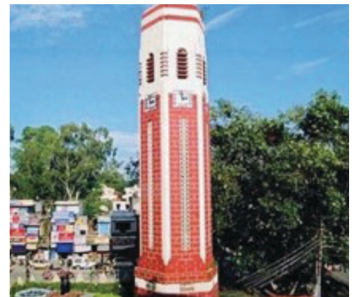
Clock Tower, Dehradun