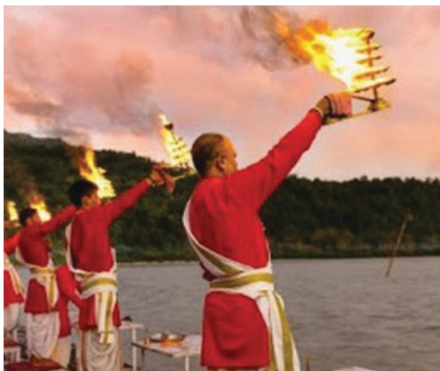
Ganga Aarti, Rishikesh