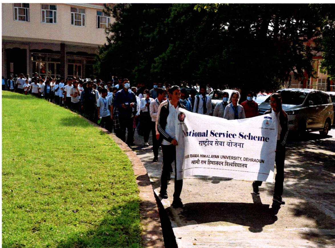
Rally for Voter Awareness conducted by NSS in the nearby area of the university