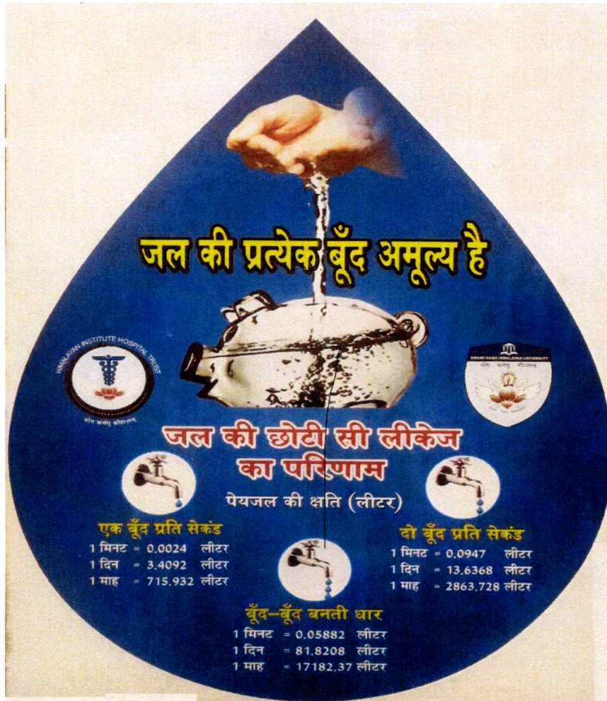
Save Water Abhiyaan drive by NSS in the University Campus