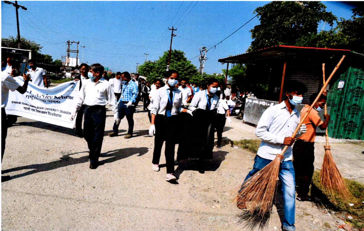
Swachhata Abhiyaan conducted by NSS in the Campus & Nearby Location of the University