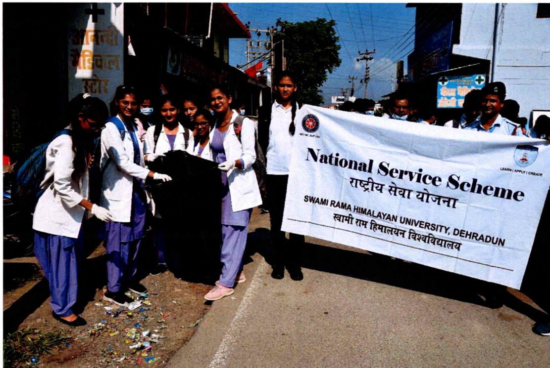
Swachhata Abhiyaan activity conducted by NSS in the Campus and nearby location of the University