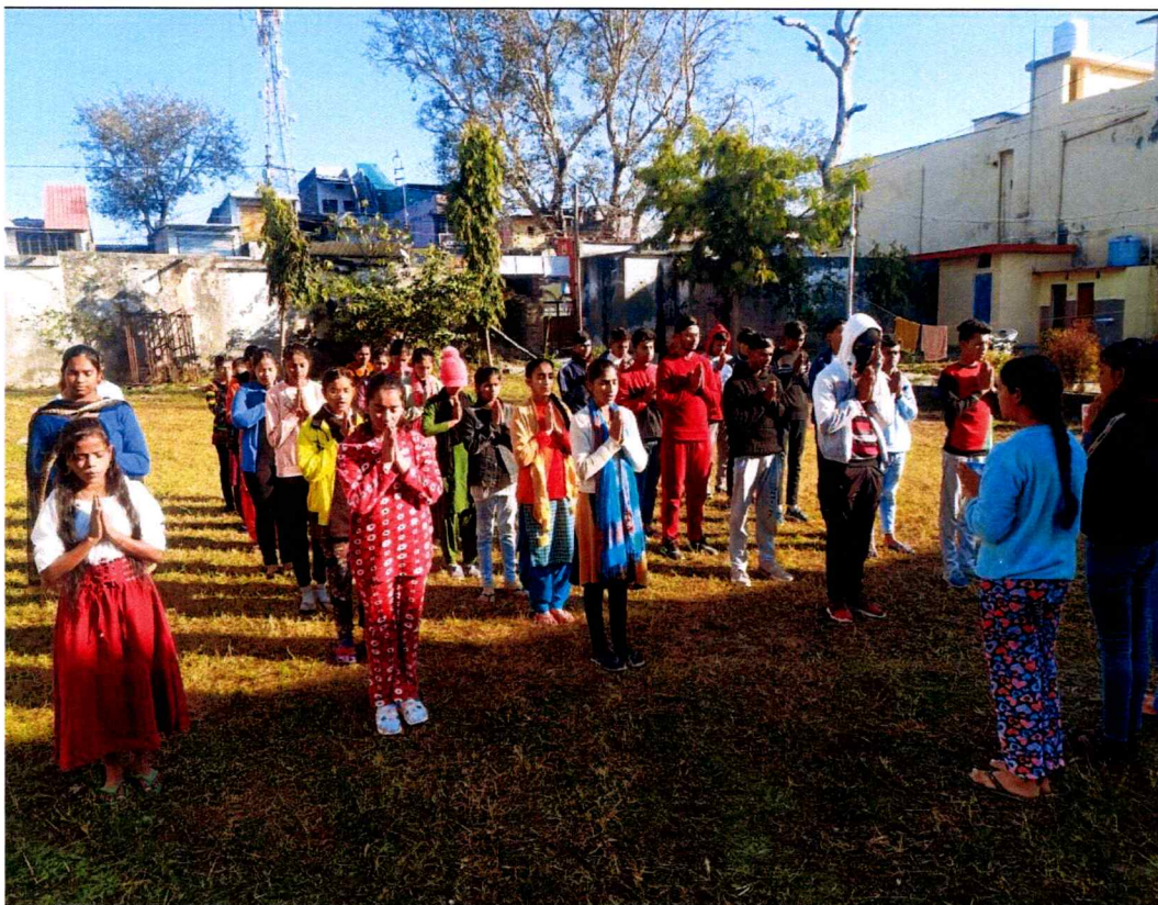
Prevention of slums through Social Education conducted by NSS in the Slums Areas, Rajeev Nagar Doiwala