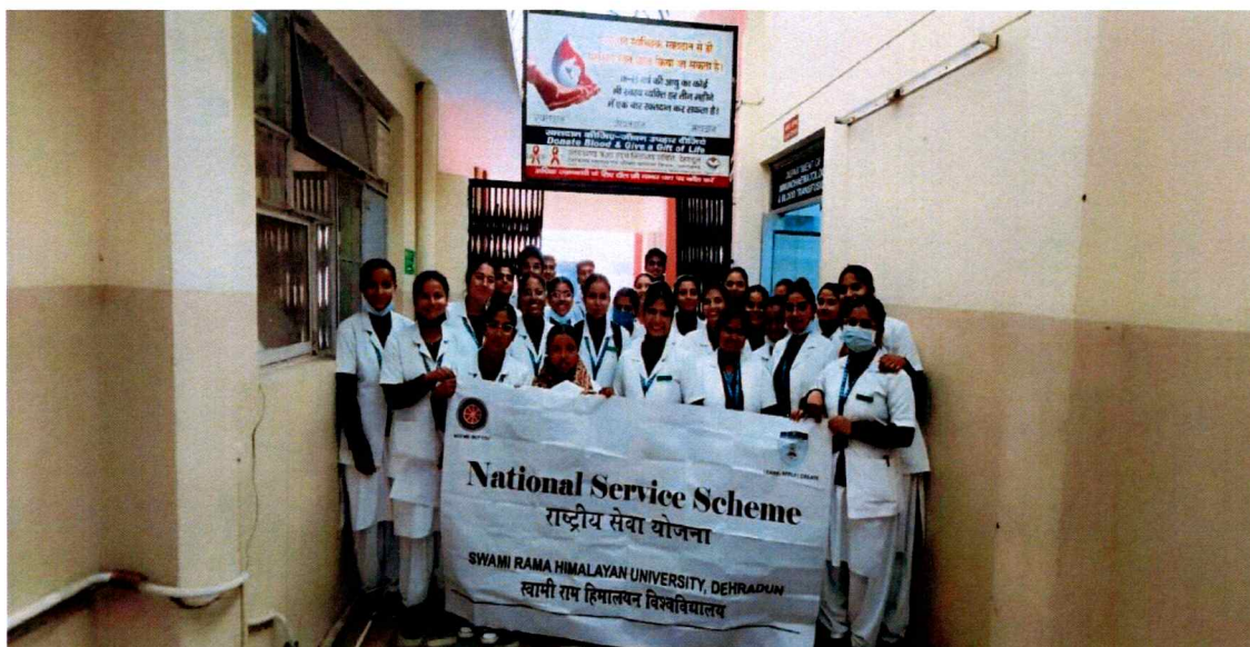
Blood Donation Camp conducted by NSS at Himalayan Hospital University Campus