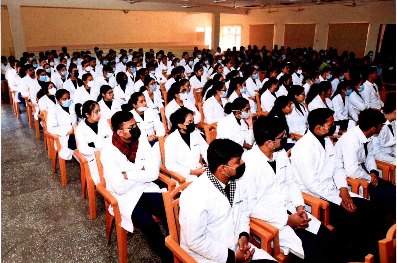
National Youth day is celebrated by NSS at Himalayan Institute of Medical Sciences