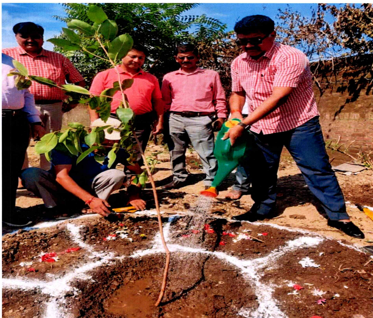
Plantation drive conducted by NSS at University Campus