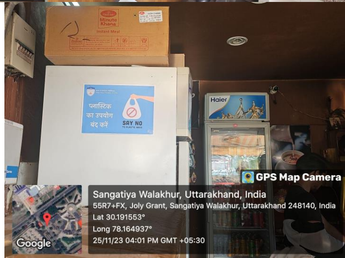
Plastic-Free Campus signage at Swami Rama Himalayan University promoting sustainability.