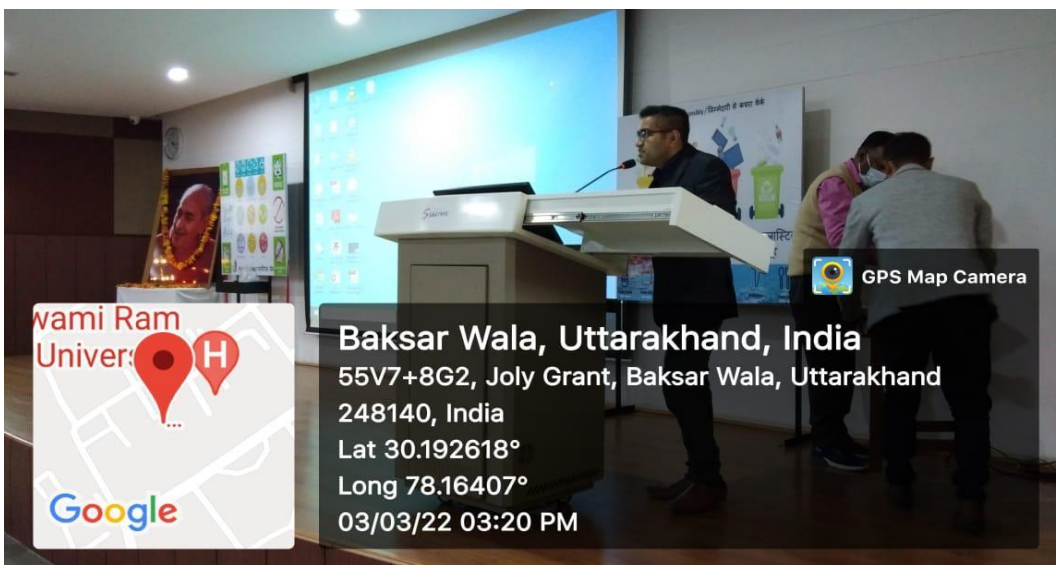
Awareness campaign at SRHU on plastic waste management and sustainability