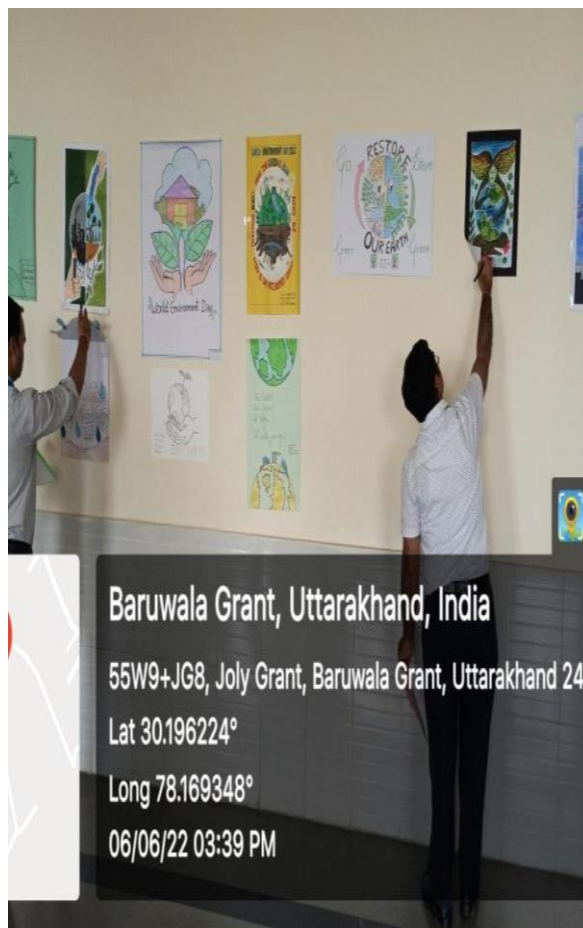
Poster and Quiz competition under progress on World Environment Day