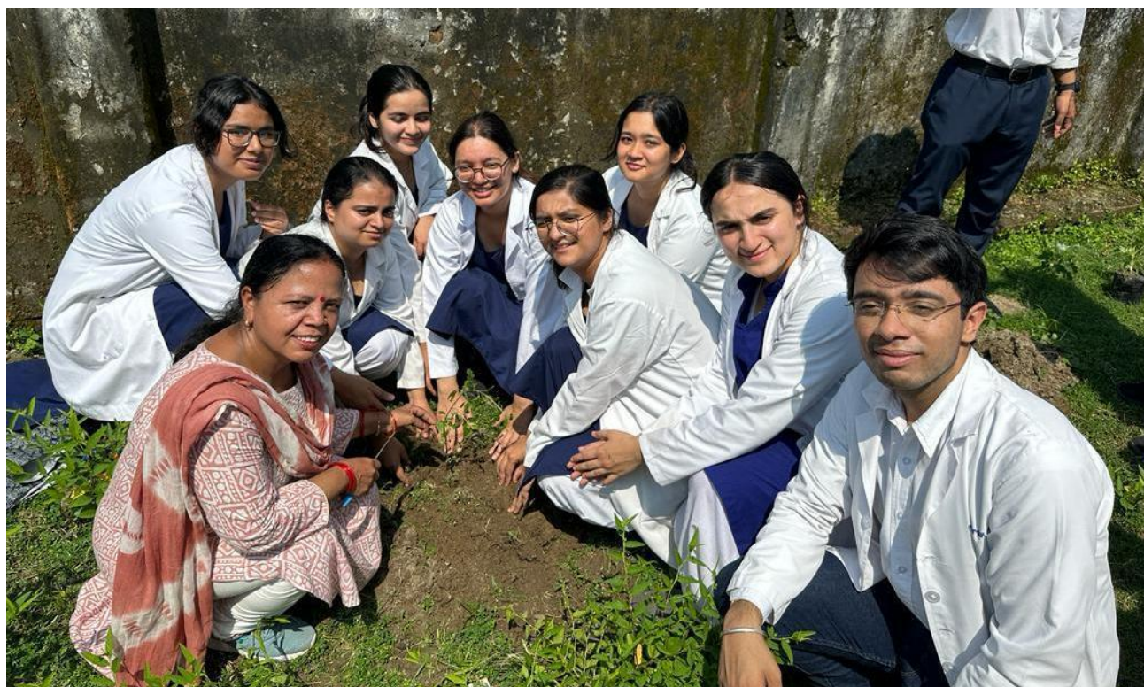
Students participating in tree plantation drive in the community