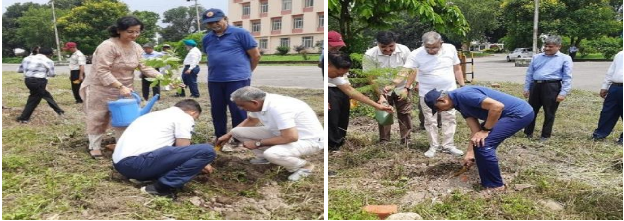
Plantation drive on the occasion of Harela festival