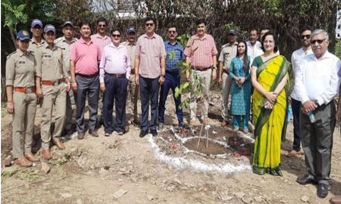
Plantation campaign in action at SRHU in association with Uttarakhand Forest Department