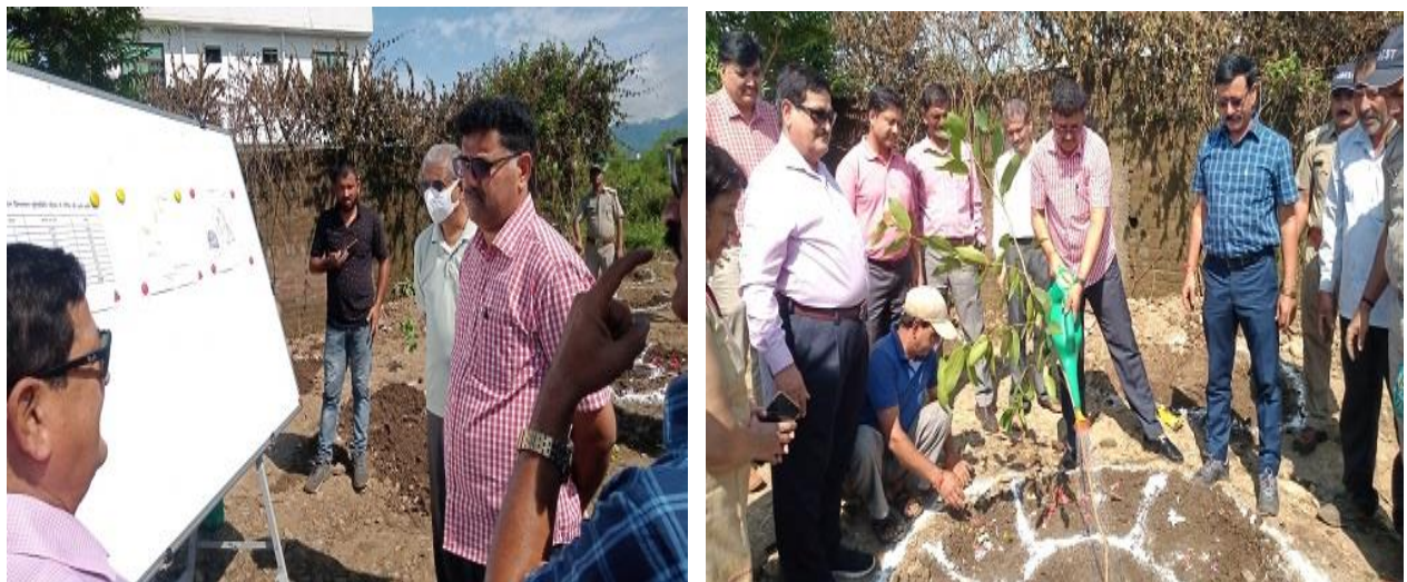
Plantation campaign in action at SRHU in association with Uttarakhand Forest Department In alignment with the Namami Gange Integrated Conservation Mission

In alignment with the Namami Gange Integrated Conservation Mission, SRHU initiated an extensive plantation campaign with the Uttarakhand Forest Department. A four-kilometre green belt is being developed with over 3,300 trees including Kachnar, Burans, Bedu, Guriyal, Semal, Sal, and Tun species. This initiative is part of SRHU's long-term Green Campus Initiative aimed at reducing pollution, enhancing biodiversity, and supporting the Ganga River catchment.