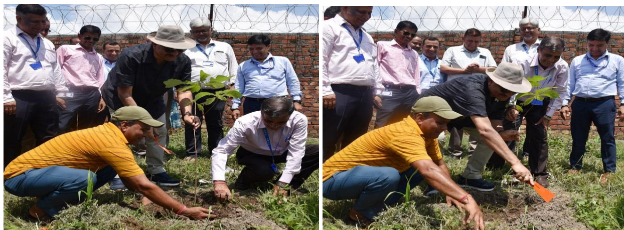
Ocassion of harela being marked by planatation drive