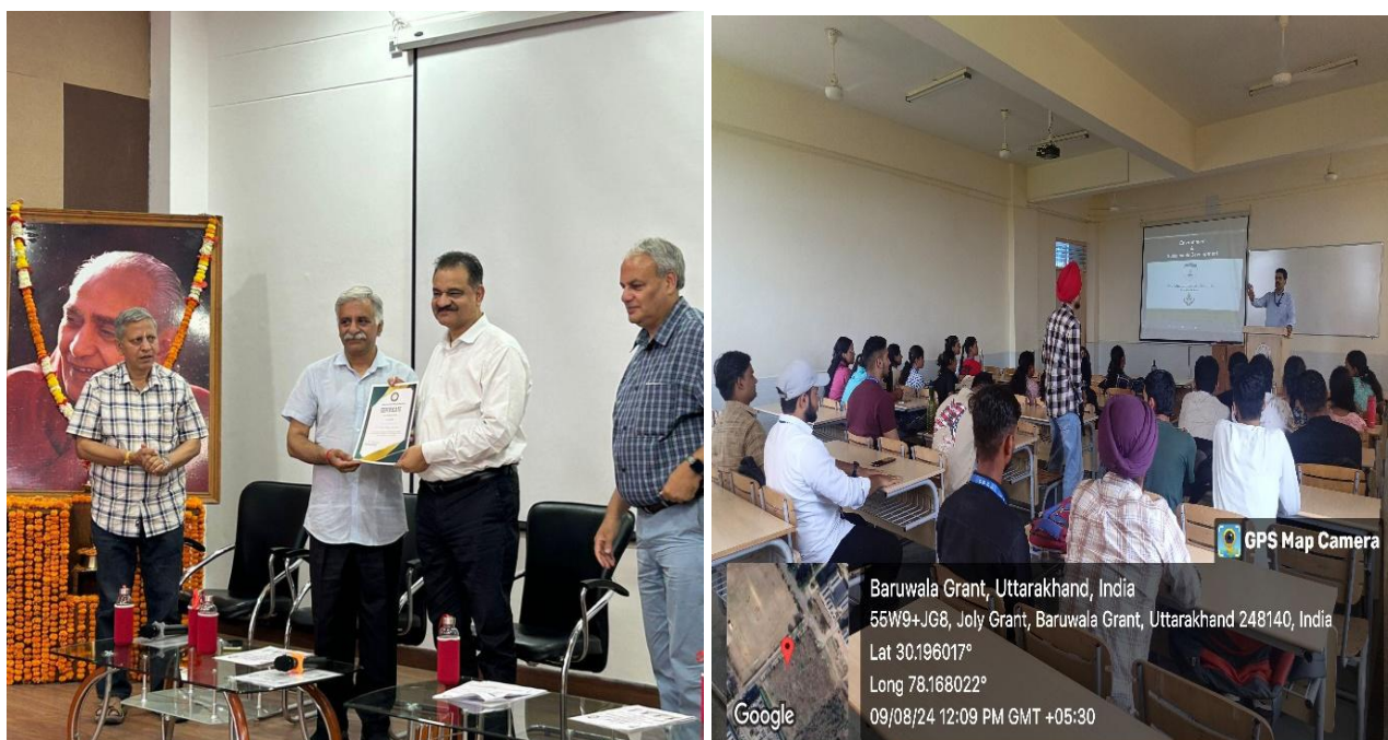
Guest talks and special lectures conducted for students to sensitize students on the conservation of environment