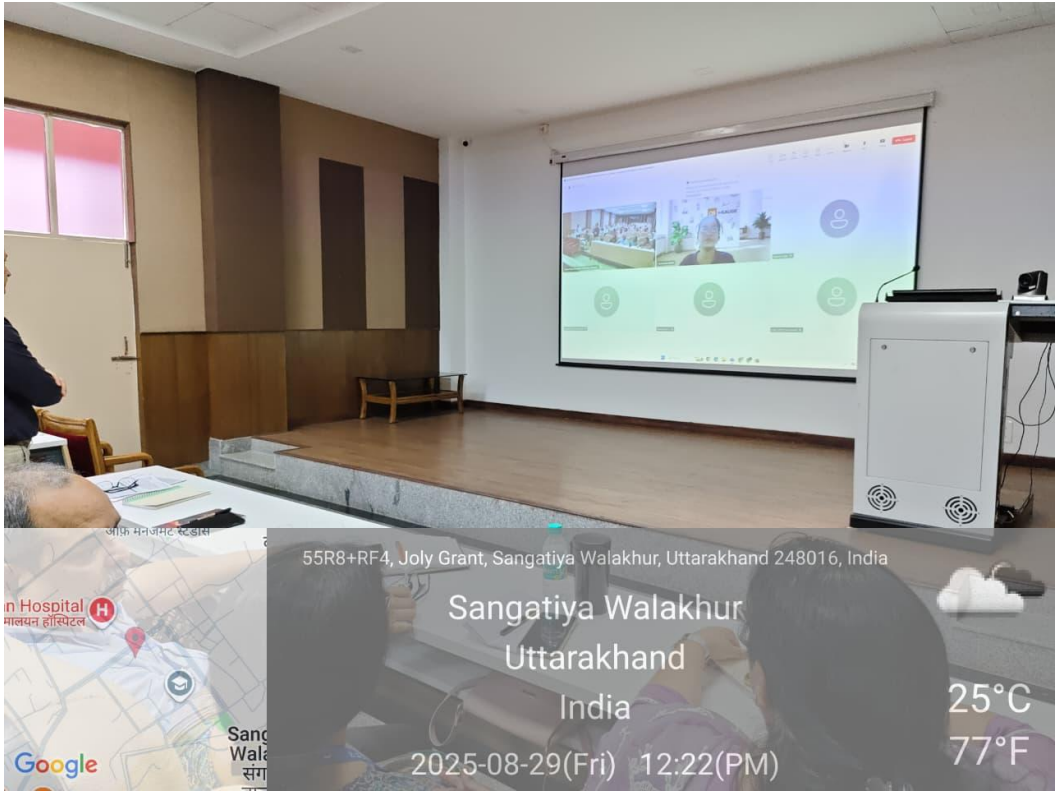
Orientation QS-I-Gauge in Online Mode