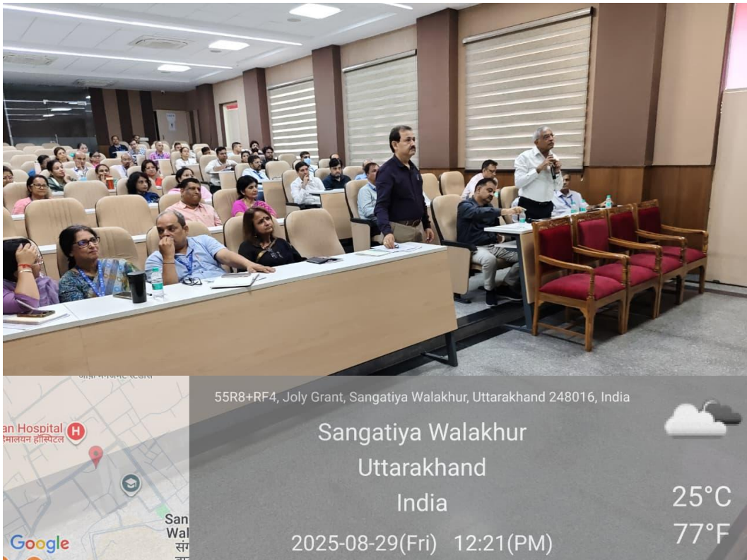
Q & Answer Session by SRHU Team